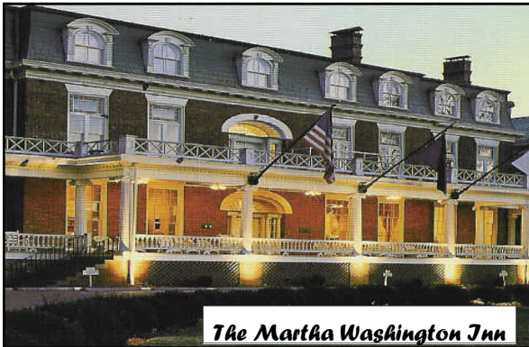
The Martha Washington Inn