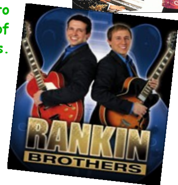
THE RADISSON BRANSON