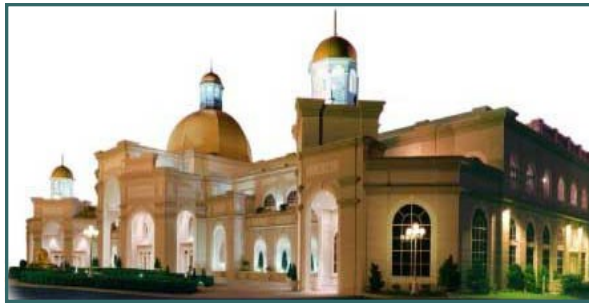
Sight & Sound Theatre